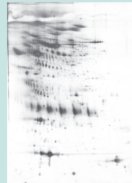
CSF with abundant protein depletion